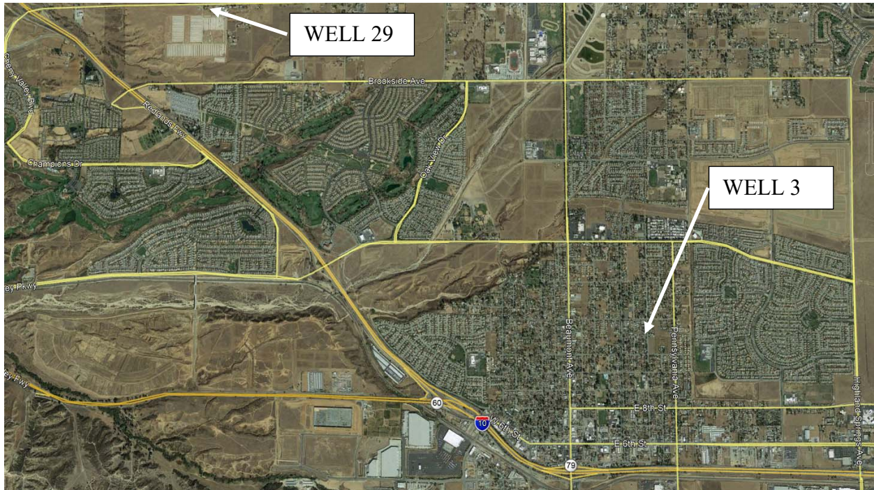
FIGURE 1 WELL 29 AND WELL 3 LOCATION MAP