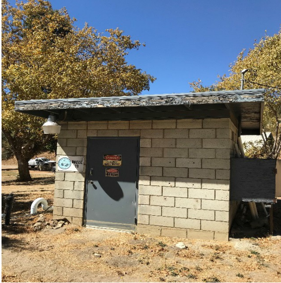
Well 11 Block Building with Weed Roof