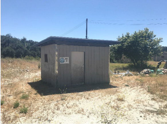
Well 20 Building