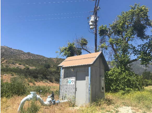
Well 19 Building