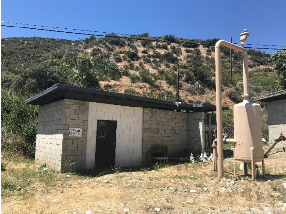
Well 12 Building