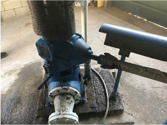
Well 12 Angle Drive Connection