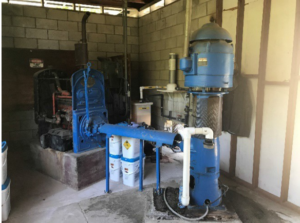
Well 12 Motor with Angle Drive